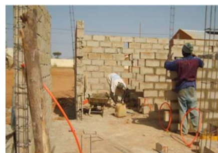
Building site - March 2008

association.morgane@numericable.fr www.association-morgane.org