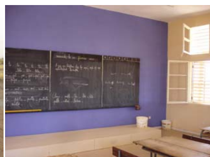
The blue class

Thank you : the ambition of our association is large and you are all part of it. Our hope for the following years is to start the building of a preschool for the end of 2008 in order to open two classes for the scholar year 2009... with rhythm and continuity. Thanks for joining us.