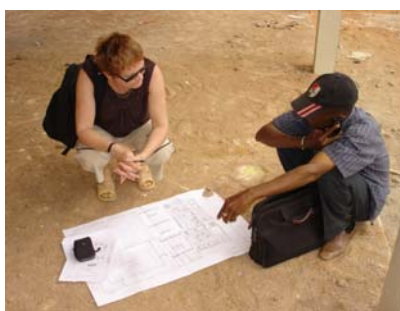
On the building site

In 2009, we will have to start the first maintenance actions. The buildings will be in use for five years already. There are many users and even if everyone is careful works like painting maintenance and general maintenance are necessary.