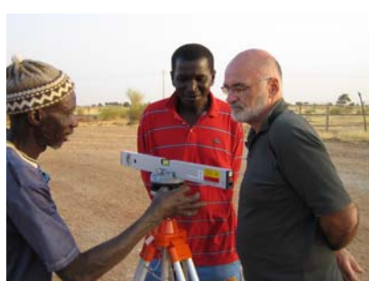
Discovery of laser level