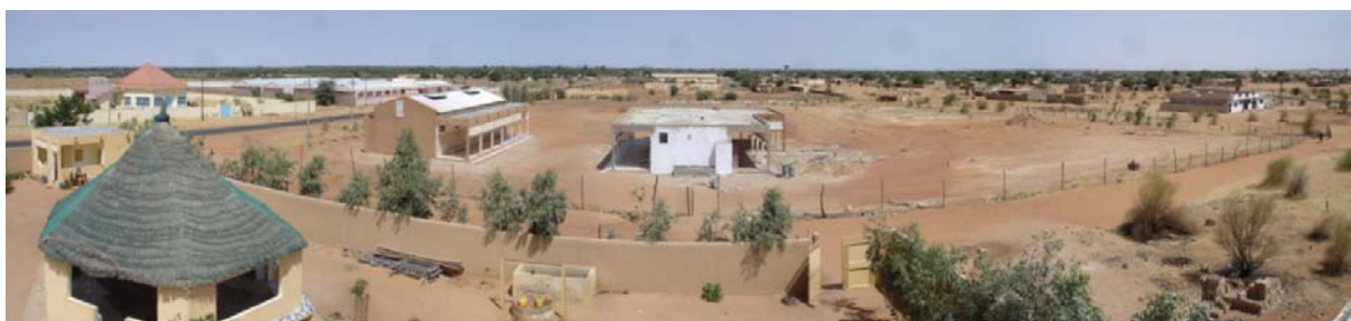
First two buildings of the school from the roof of the centre Morgane

The third building includes two class rooms and toilets. The funds are not complete yet but we decided to start the building while we were in Dagana. We hope that the financial support we are waiting for and the help from everywhere else is coming soon.