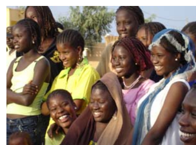
During pupils theatre